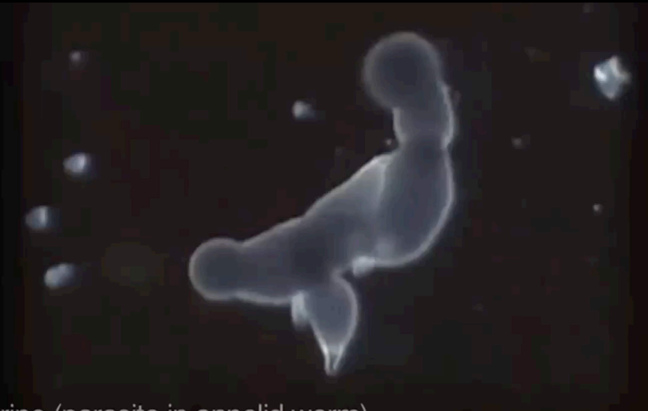
gregarine (parasite in annelid worm)