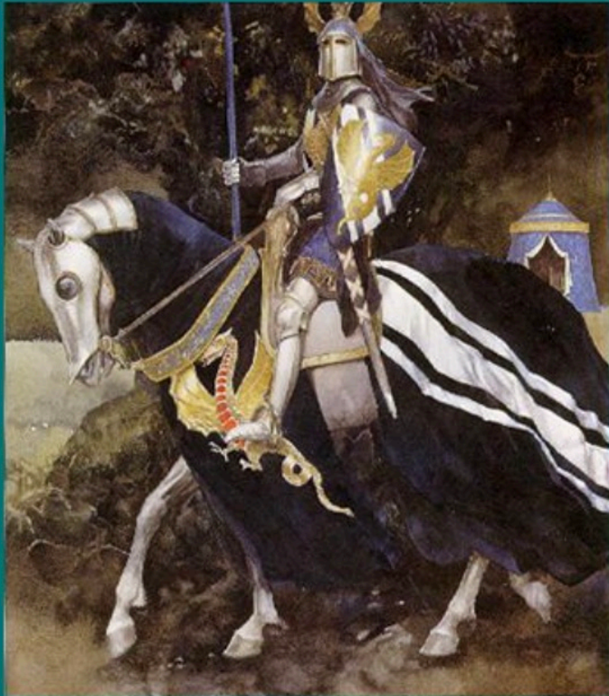
Chretien de Troyes' "The Story of the Holy Grail" from Perceval Late 12th Century