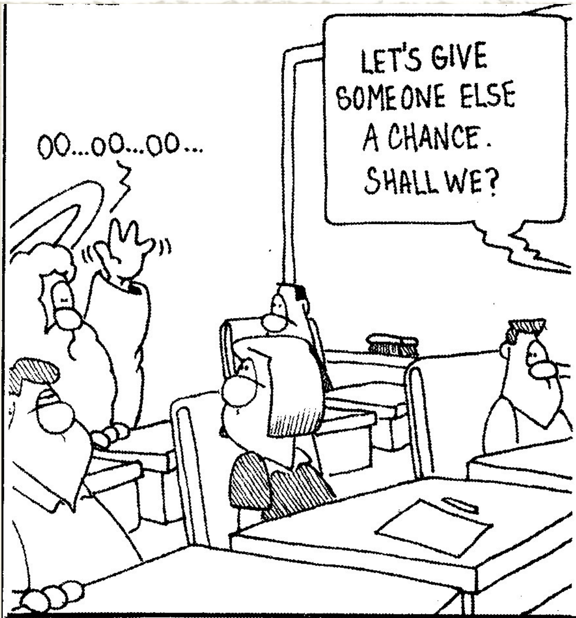
ANOTHER COMPELLING REASON TO KEEP GOD OUT OF THE CLASS ROOM...