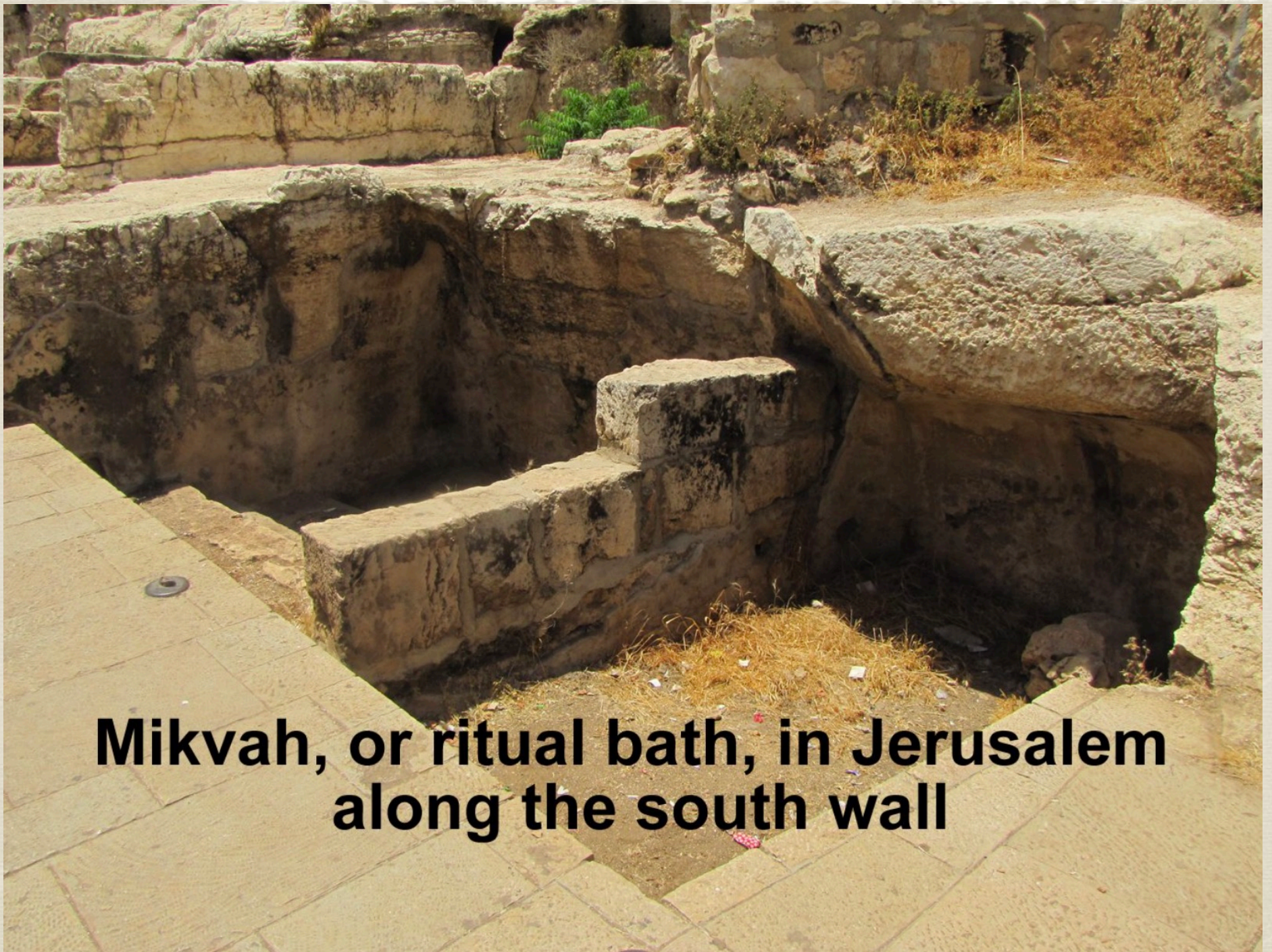
Mikvah, or ritual bath, in Jerusalem along the south wall