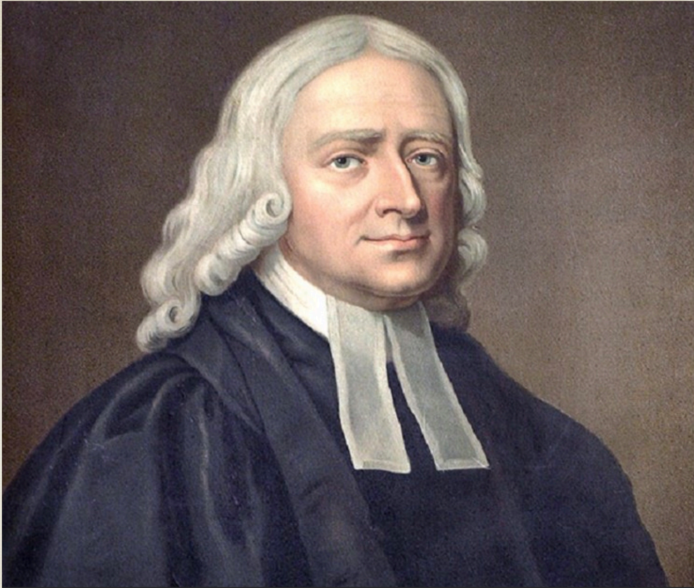
John Wesley 1703 - 1791