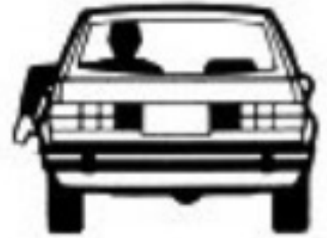
Slow or Stop