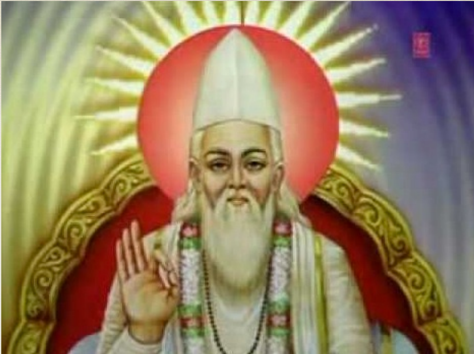
Kabir 1398 - 1518